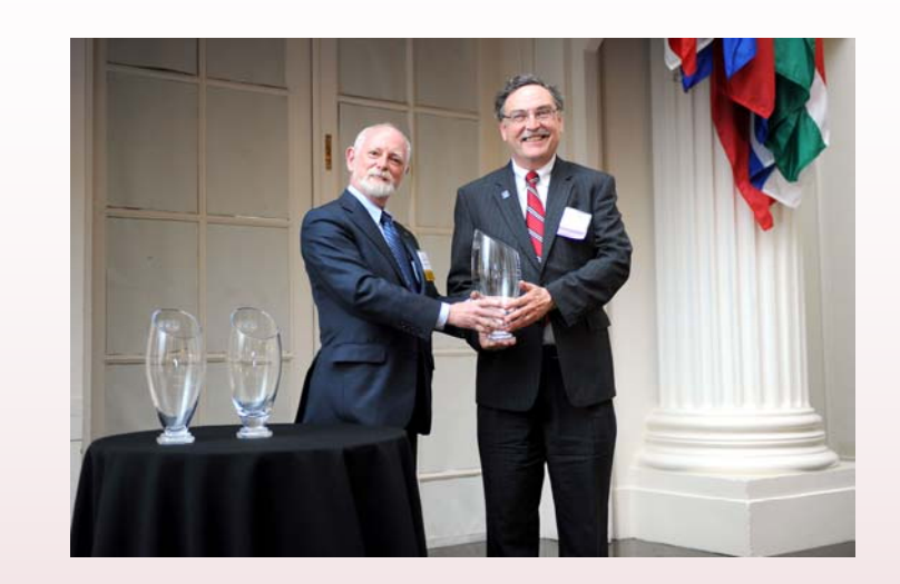
Legal Counsel for the Elderly