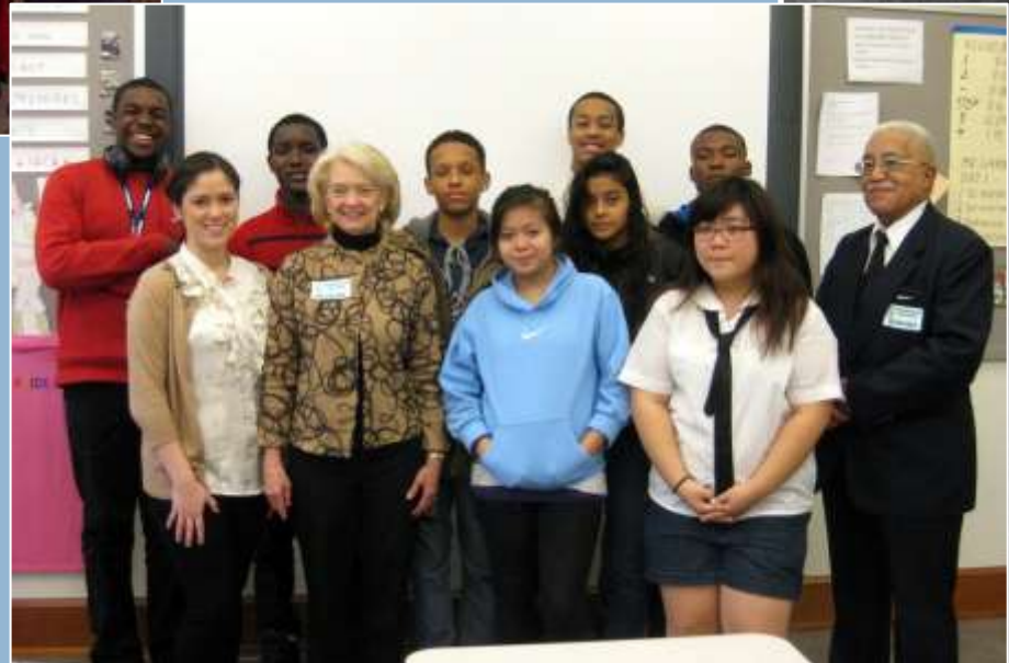
Background: Hon. Gregory Mize with students at Terrell High School