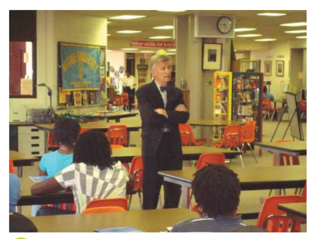
Judge Greg Mize