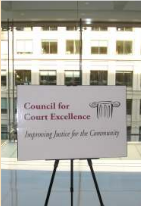
The Handbook publication reception at the Pew Center for the States