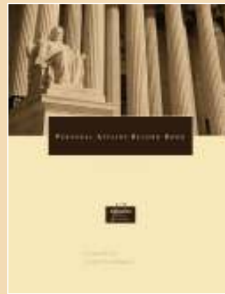
New editions of When Someone Dies and the Personal Affairs Record Book are available on the CCE website or by calling our offices.